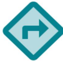
2 Indirect Effects

Direct Effects are the initial effects to a local industry or industries due to the activity or policy being analyzed