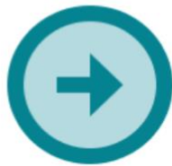
1 Direct Effects

The economic impact of an Industry consists of the following three types of effects which sum to the total effect.